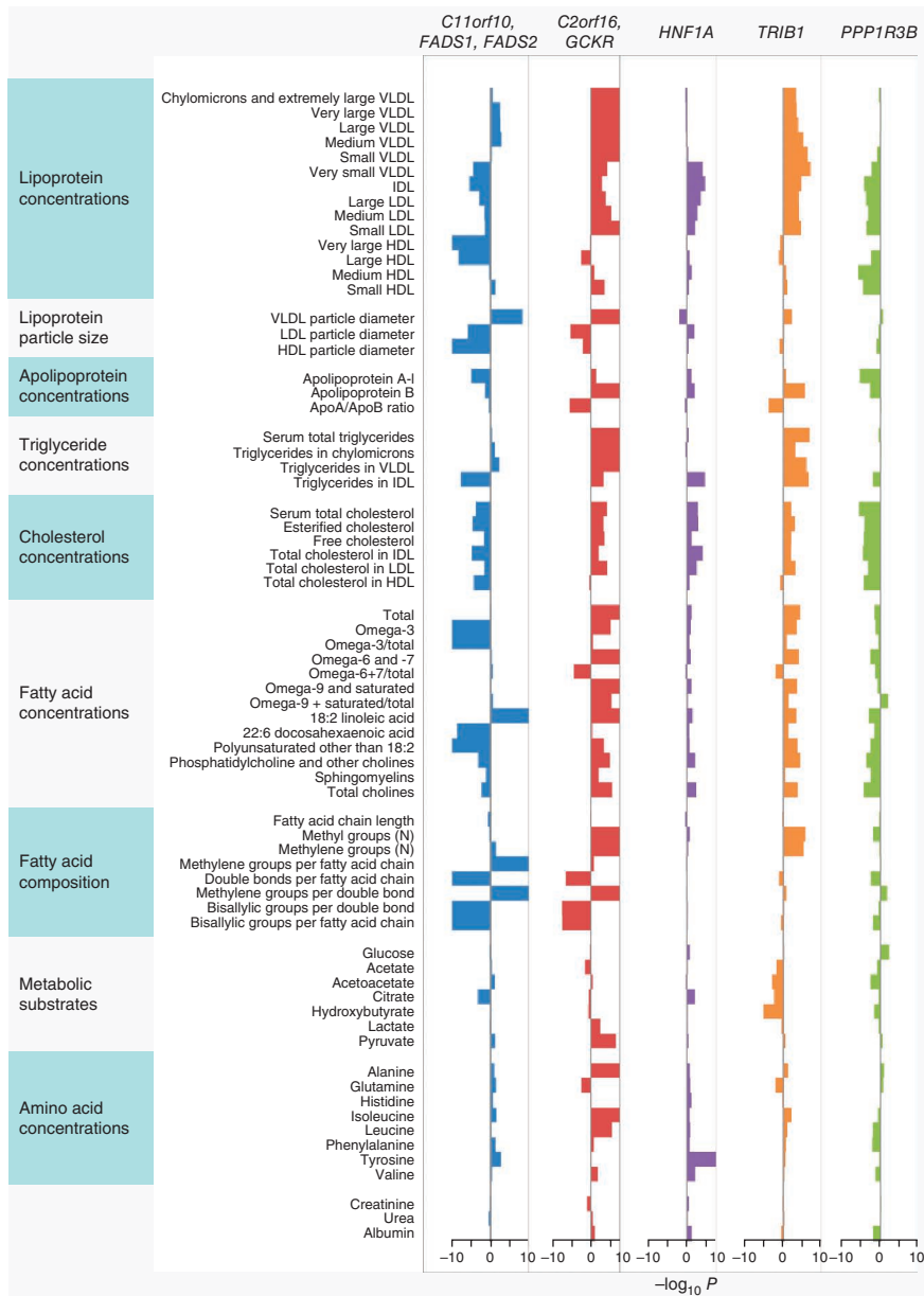
Figure 3 Association of FADS1 , FADS2 , GCKR , HNF1A , TRIB1 and PPP1R3B loci with NMR metabolome. Bars are for -\log_{10} P value, signed for direction of effect.

and glycosylation ( ST3GAL4 , FUT2 and ABO ) and glutathione metabolism ( ALDH5 , GGT1 and GSTT1 ).